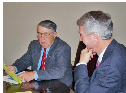
UACD officials meet with members of government to provide information on conservation issues and advocate for good stewardship.

Available government programs often provide incentives such as technical and cost-sharing assistance to implement projects. Conservation planning, engineering, and GIS/GPS services are available from the Utah Association of Conservation Districts. Districts promote and fund educational activities for children including fairs, field days, and in-classroom presentations. They also offer scholarships to local high school students and sponsor teams participating in the annual Utah Envirothon and Nature High Camp.