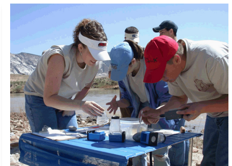
Hands-on educational events inform students about natural resource issues, multiple use management and conservation.